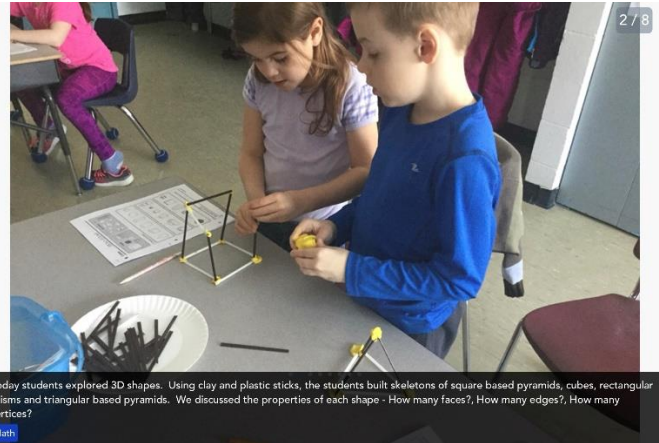
Today students explored 3D shapes. Using clay and plastic sticks, the students built skeletons of square based pyramids, cubes, rectangular prisms and triangular based pyramids. We discussed the properties of each shape - How many faces?, How many edges?, How many vertices?